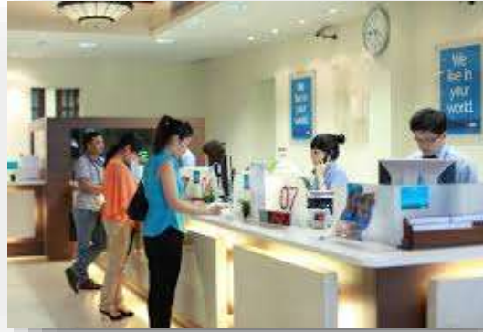
Any Bank, Any Branch