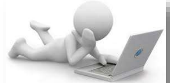
Any Banks' Net Banking module