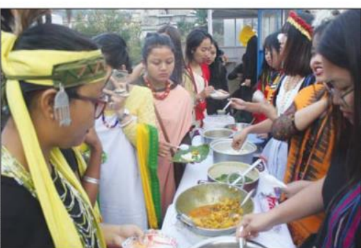
Students of Martin Luther Christian University during the indigenous food tasting event in Nongrah on Tuesday.

Tuesday at the MLCU main campus in Nongrah with a panel discussion on the topic 'Protect, preserve, promote the indigenous languages of the Northeast'.