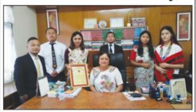
By Our Reporter

SHILLONG: The Department of Tourism and Travel Management MLCU recently celebrated World Tourism Day by reaching out to students from different schools.