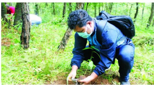
A staff of MLCU plants a sapling

SHILLONG: With the objective to build a greener city, Martin Luther Christian University (MLCU) and Rotary Club of Orchid City Shillong (RCOCS) in collaboration with Meghalaya Integrated Mountain Development Initiative (MIMDI) and Rotaract Club of North-Eastern Hill University (NEHU), organised a tree plantation programme at Umsawli, Mawpat on Wednesday, and Lum Warkhyllew, Umphyrnai on Thursday.