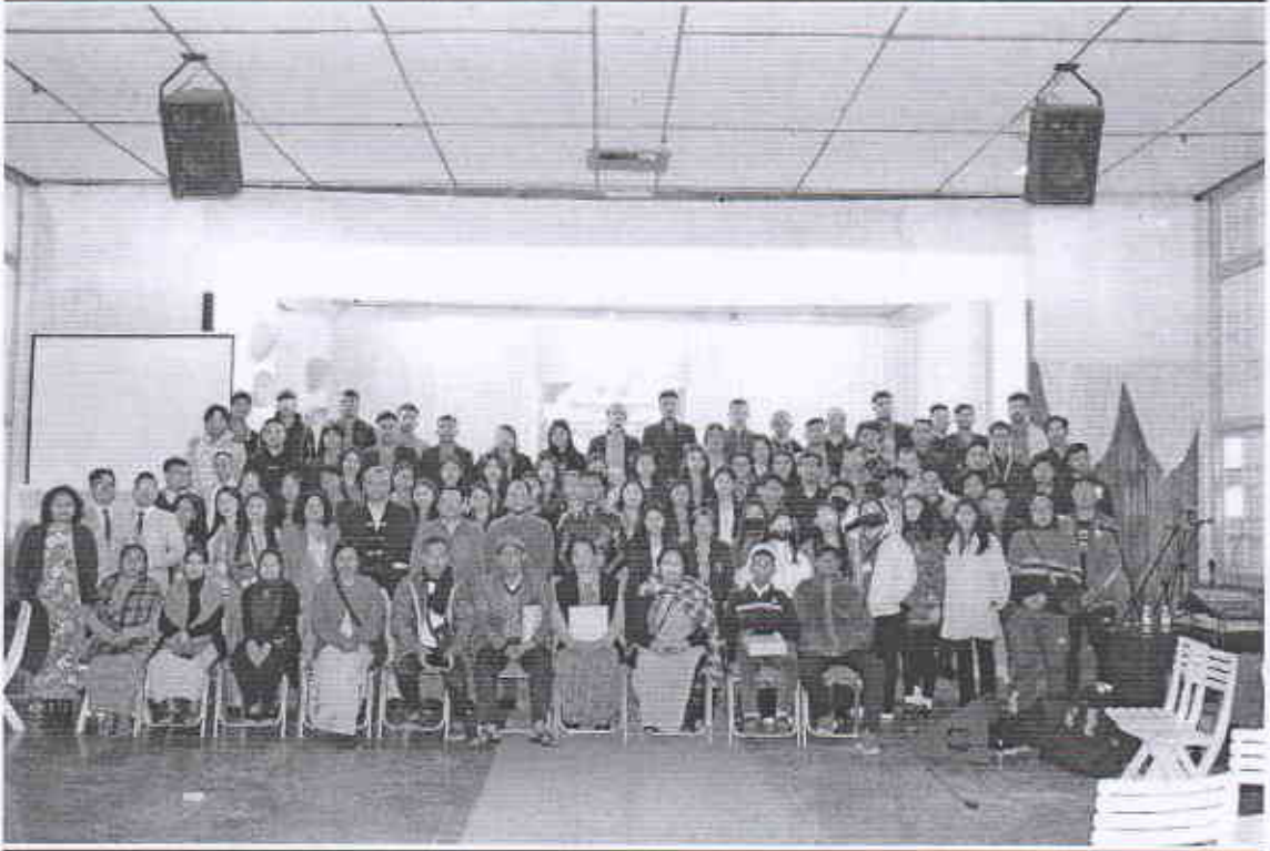
SCHOOL OF ECONOMICS, COMMERCE AND MANAGEMENT Martin Luther Christian University, Shillong, Meghalaya